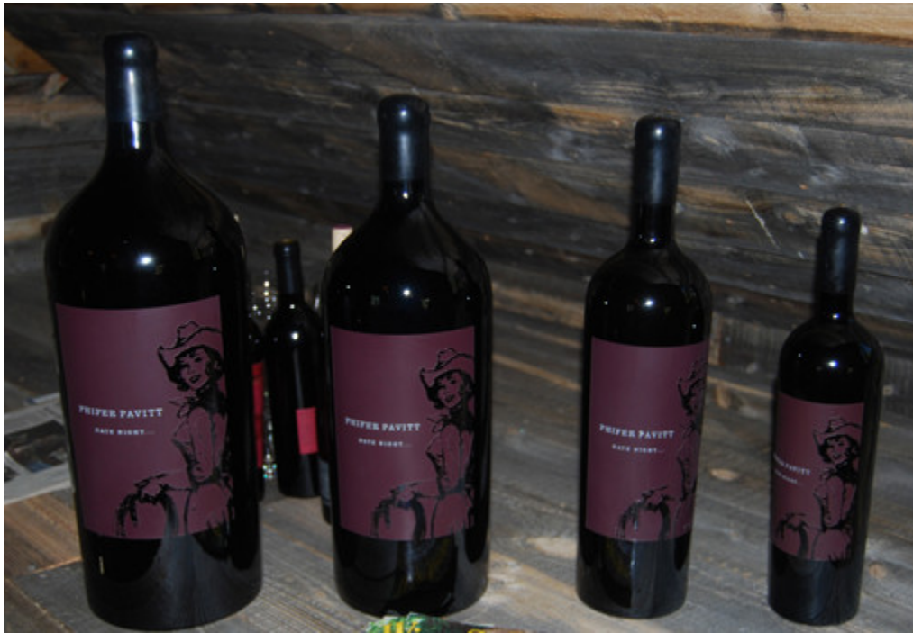
Phifer Pavitt Date Night Cabernet Sauvignon